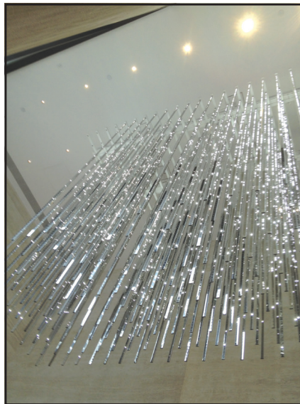
Light sculpture in the Durst lobby.