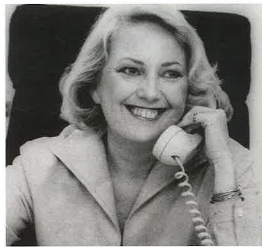
FIRST WOMAN OF FINANCE: Muriel Siebert in 1977, a decade after she became the first woman to own a seat on the New York Stock Exchange. She died Aug. 24 at the age of 84.